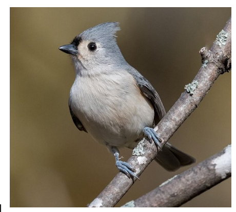
Tufted Titmouse

The trail will soon turn hard to the left, and you'll begin to walk the boundary with the nearby neighborhood. The trail rises slowly until you reach the high point, where you'll see the other end of the fireline you passed earlier, and an ephemeral pool on your left. Ephemeral or vernal pools are temporary wetlands that may or may not have standing water, and serve as a protected place for amphibians and insects to breed and grow. Come back in April and look for the pool again, and you'll most likely find several hundred tadpoles scattered within it.