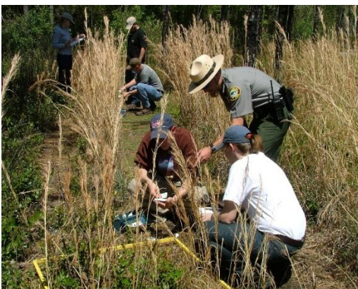
Rangers and citizens counting Venus Flytraps.

The endangerment of carnivorous plants is a problem in our environment. Carnivorous plant species are endangered because of overcollection and habitat loss. People are poaching or taking too many plants from the wild. When humans develop natural habitat into places