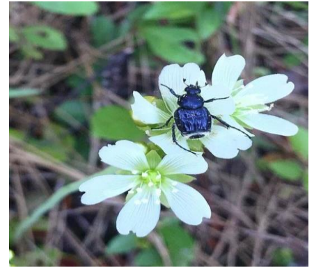
A pollinator getting some nectar.

All these carnivorous plants are also flowering plants. So how do they attract both pollinators and prey? The most common pollinator for flowering carnivorous plants is bees and hoverflies. The most common prey of the carnivorous plants are gnats, flies, moths, beetles, and ants. Venus flytraps have adapted ways to help them separate the prey from the pollinator.