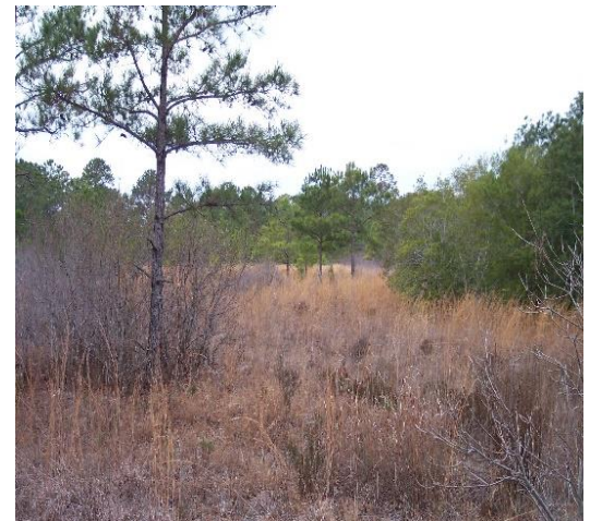
Longleaf Pine Forest

like neighborhoods, farms, and roads these wild plants do not have what they need to survive. We as citizens have a responsibility to protect these unique and special plants.