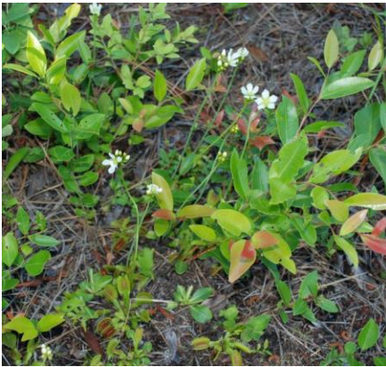
Flowers are high up on the plant stem.

First, the flowers grow up high while the trap is lower to the ground. Second, the white color of the flower and nectar attracts certain pollinators, but the trap's red colors and smell attracts insects as prey. It is in the Venus flytrap's best interest to tell the difference between the pollinator and prey.