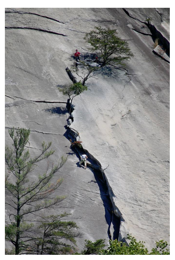
Stone Mountain State Park