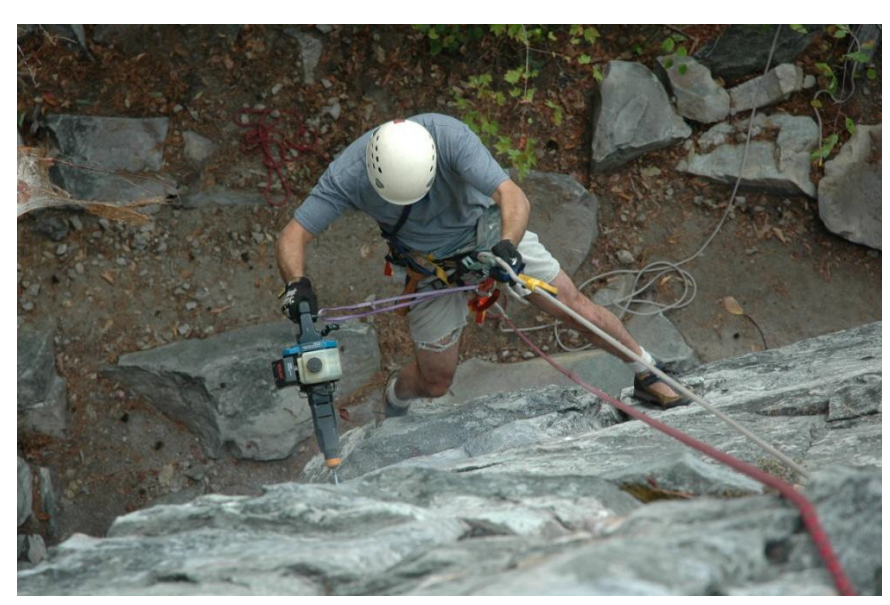
Anchor replacement, Pilot Mountain State Park

The replacement of fixed anchors on established routes or belay stations will be allowed whenever climbers notify park staff that existing fixed anchors are unsafe. Upon notification, park staff will immediately post information at climbing information kiosks, permit kiosks, and park offices advising climbers that suspect anchors may be present on a specific route. The route in question may remain closed until repairs are made.