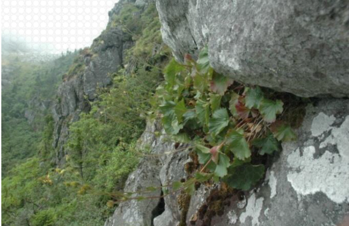
Spreading Avens, Grandfather Mountain