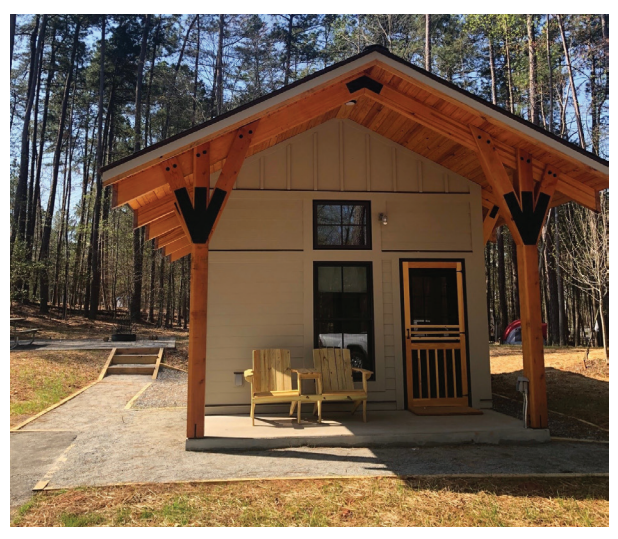
New campground at Lake Norman State Park