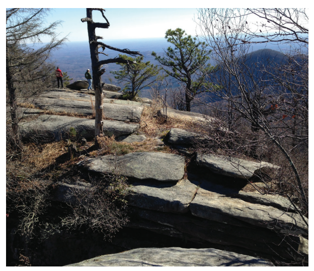
Hickory Nut Gorge State Trail