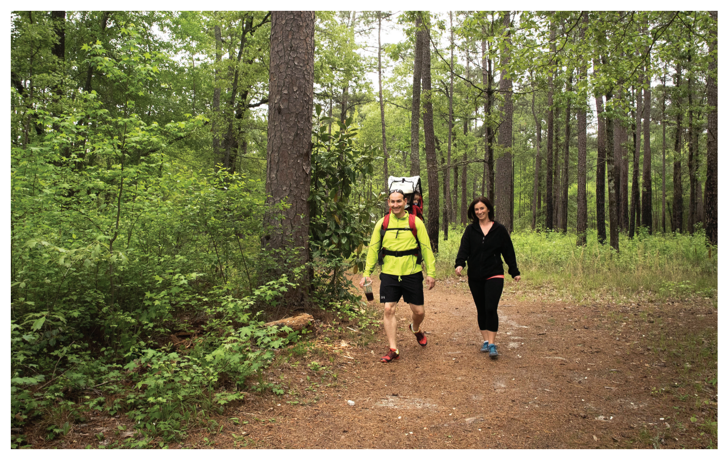
Carvers Creek State Park

PATH funding was a tremendous support for state parks operations during the peak of the pandemic, providing UTV's for medical response, trail repair and building equipment, radio equipment for park rangers and maintenance staff, traffic counters to help manage park crowding, and new medical equipment including expanding our inventory of life-saving AEDs.