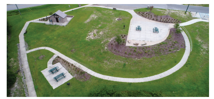
Slocum Creek Park