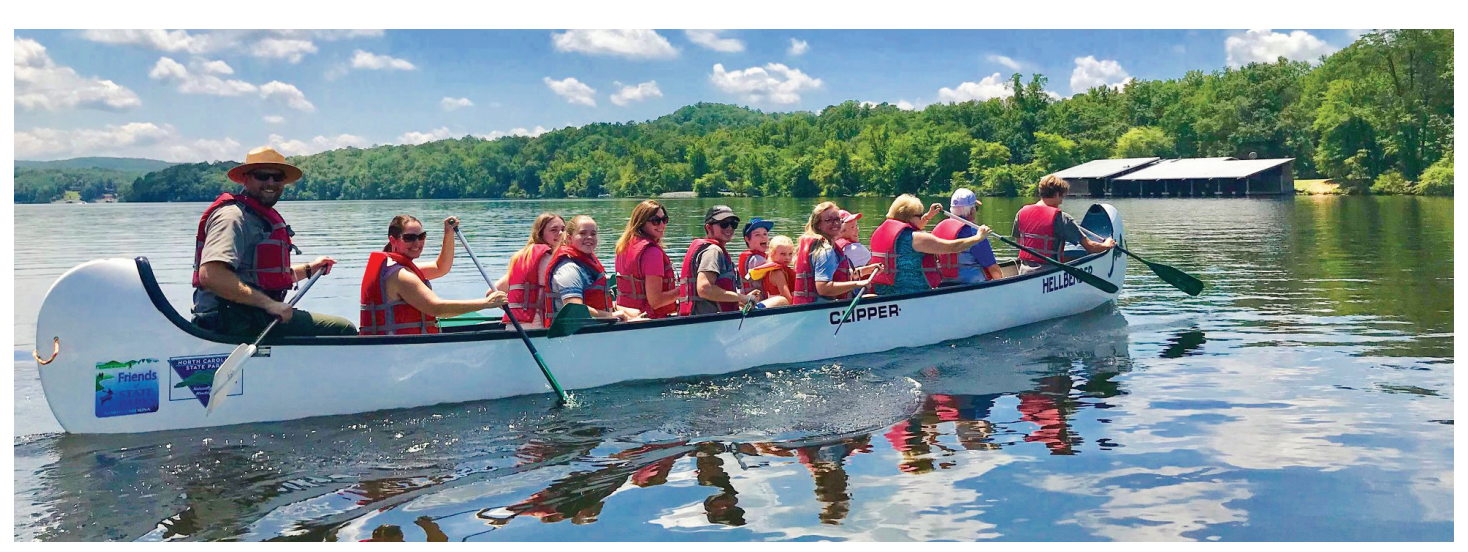
Our Big Canoe, "Hellbender," at Morrow Mountain State Park