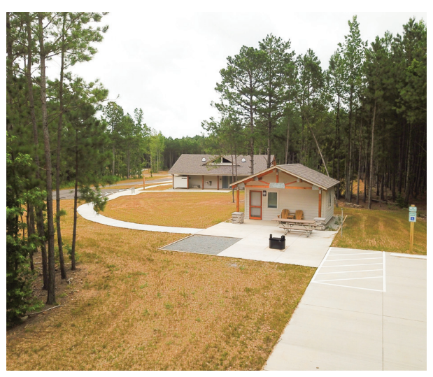
New campground at Raven Rock State Park