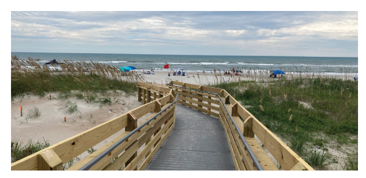
Durham Street Beach Access, Atlantic Beach

The Parks and Recreation Trust Fund awarded 17 local grants totaling $5.3 million for park, trail, greenway, and land acquisition projects for towns and counties. In addition, the trust fund distributed $10.3 million to state parks for land acquisition, capital improvement projects, repairs and renovations.