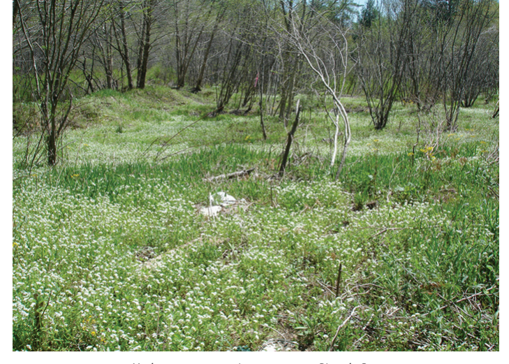
Prescribed burn at Carvers Creek State Park