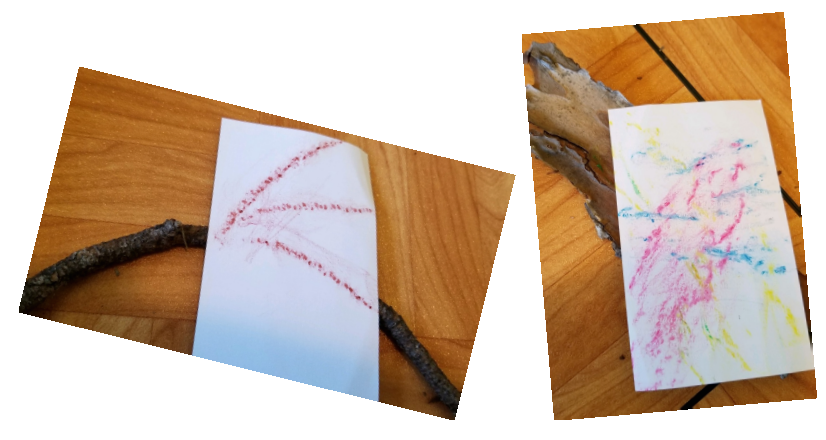
For more fun: Try using other items you find around inside or outside to see if they make cool rubbings as well! - Just remember not to break anything off any live animals or plants.*