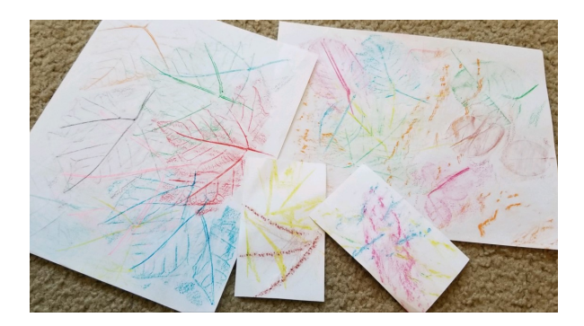
*Remember you can try leaf rubbings with one leaf at a time or arrange several of the leaves under the paper before you start.*